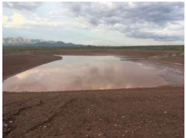
Horseshoe Draw Sediment and Flood Control/ Recharge Project

Hydrologic monitoring at CCRN project sites where regional groundwater declines are of most concern revealed some welcome news.